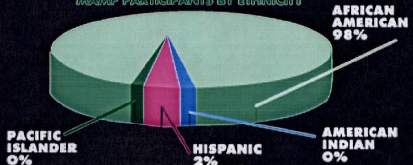
MAMP PARTICIPANTS BY ETHNICITY

LeMOYNE-OWEN COLLEGE, LEAD INSTITUTION ARKANSAS STATE UNIVERSITY CHRISTIAN BROTHERS UNIVERSITY MID-SOUTH COMMUNITY COLLEGE RUST COLLEGE SHELBY STATE COMMUNITY COLLEGE STATE TECHNICAL INSTITUTE TENNESSEE STATE UNIVERSITY UNIVERSITY OF ARKANSAS AT PINE BLUFF UNIVERSITY OF MEMPHIS UNIVERSITY OF TENNESSEE, MEMPHIS MEMPHIS PARTNERS, INC. GLOBAL CONCEPTS, INC. GRANT INFORMATION CENTER, INC.