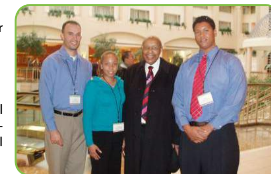
U.S. Congressman Louis Stokes and FGLSAMP Students in Washington D.C.

FGLSAMP has also been significant in the overall increase of baccalaureate degrees awarded to URM students in STEM, due to its ability to enhance the learning experience of STEM students during their academic careers. There have been significant increases in STEM enrollment at both the undergraduate and graduate levels. The successful matriculation from undergraduate FGLSAMP scholars to STEM graduate programs the is due in large part to the components and activities outlined within this document, but also in no small part; to the dedicated faculty, staff and institutional administrators who believe in the mission of FGLSAMP.