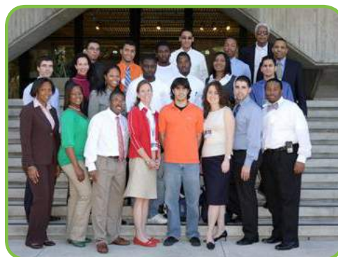
FGLSAMP BD at Univ. of Florida